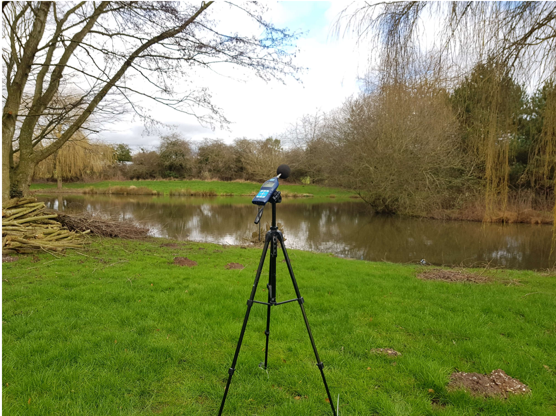
Picture 1: Noise measurement conducted with a class 1 sound level meter