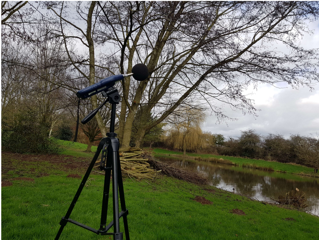
Picture 3: The ,meter remained in the same location during the measurement duration